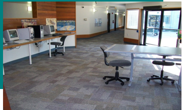
New carpet tiles in the Myers Court common areas looks great and are easy to replace and maintain. QUAD Inc. hopes to install similar tiles at Central Station Apartments in 2010.